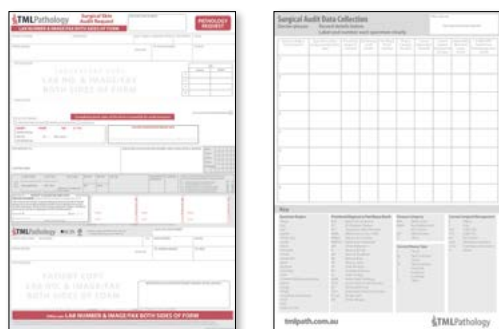
Request Form - front and back

Registered participants must submit specimens using the dedicated skin audit request forms. The reverse side of the form must also be completed in order for specimens to count toward your audit data.